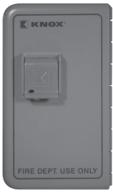
Model #1453 Shown