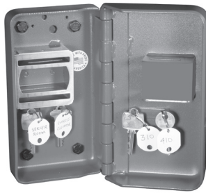
4 key hooks hold up to 8 keys

The Knox® 1450 Mini Elevator Key Box is designed specifically for the elevator lobby. The Knox Elevator Key Box provides the same quality and reliability as the standard size 1400 Series Elevator Key Box. Also, the Mini Elevator Key Box can be keyed to your existing Knox System allowing you to carry only one key for your jurisdiction.