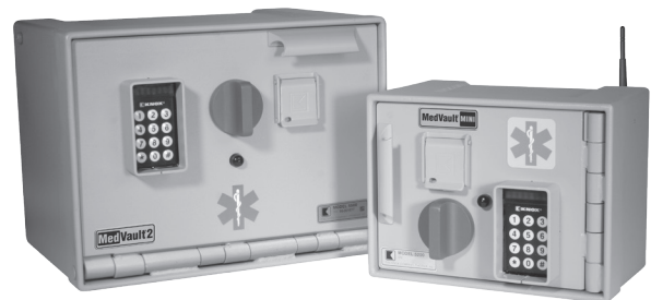
Standard MedVault® size vs. MedVault® Mini