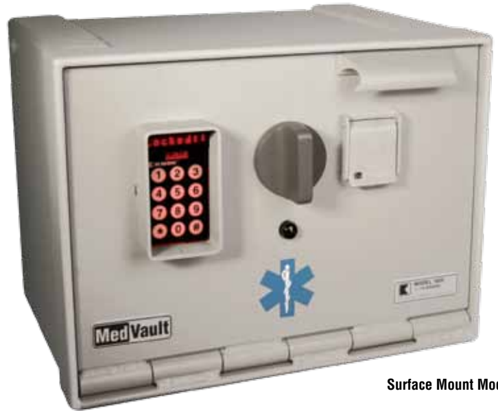
Surface Mount Model

All activity at the unit is collected in an audit trail. This audit trail is collected via a USB port and provides a time and date stamp, including a user ID for each activity. This provides the department accountability regarding access to controlled substances.