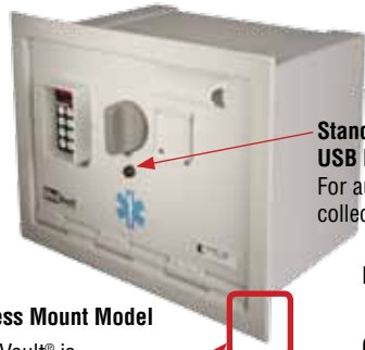
Recess Mount Model MedVault® is available with or without recess mount flange

Heavy-duty bolt action provides the security you've come to expect from Knox