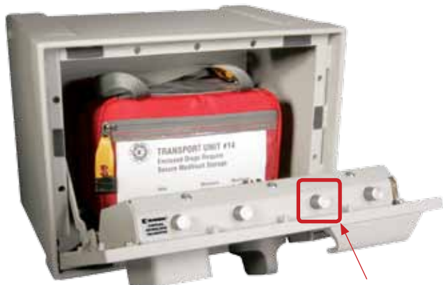
(Bag not included)

Heavy-duty bolt action provides the security you've come to expect from Knox