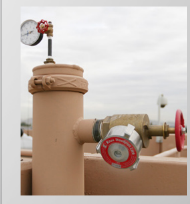
Knox Standpipe Lock on a rooftop standpipe