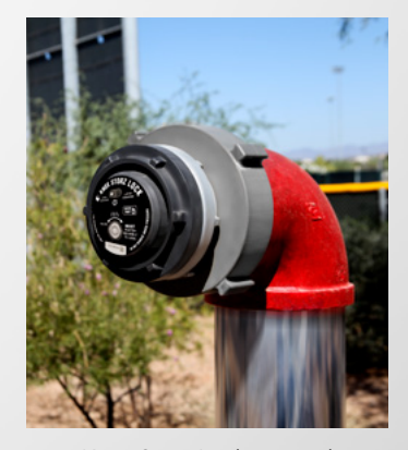
Knox Storz Lock secured onto a large FDC