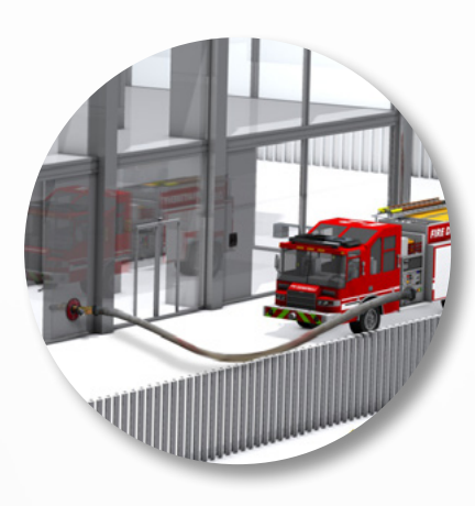
Fire department connections (FDC) are the access points where firefighters get supplemental water. Locking caps provide a strong and steady flow of water.

The Knox FDC locking cap is a great prevention measure to address the problem with clogged and damaged FDCs. There has been no pushback from our building owners. They understand the value that the FDC cap provides.