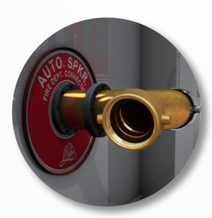
Uncapped FDCs jeopardize their performance during critical response operations.