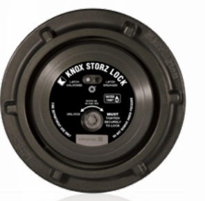
5" Diameter Model #5002