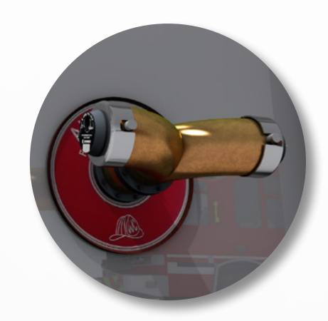
FDC Locking Caps protect the connection and keep the system operable when needed by firefighters.