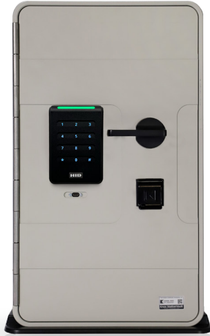
StationVault with Badge Reader

The Knox StationVault offers secure narcotics storage designed for drug resupply applications in office or medical environments. The durable flexibility of the StationVault provides storage for up to 200 vials, with wall or counter mounting options. Networking options allow all access history to be automatically uploaded to KnoxConnect ® Software Management System for review. With integrations available to send audit data to inventory systems, the StationVault can strengthen chain of custody tracking and reporting for controlled drugs.