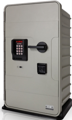
StationVault with Standard Keypad