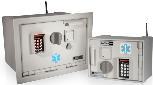
The MedVault and the MedVault Mini are available in surface and recessed mounting configurations