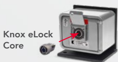
Knox eLock Core