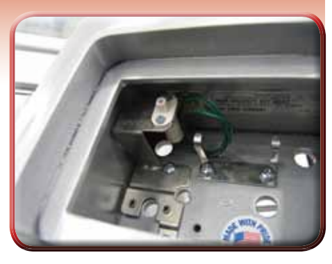
Closeup of a tamper switch for a recess mount Knox-Box<sup>®</sup>. Recess mounted Knox devices require only a door tamper switch. Wall mounted devices accommodate both door and rear tamper switches.