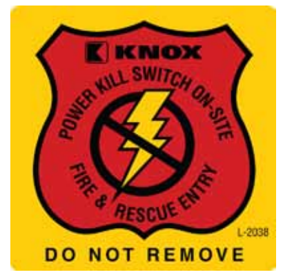
A special Alert Decal can be used when a Knox 4500 Shutdown Station is on-site

The Knox 4500 is designed to be mounted on the outside of a building giving first responders the ability to control shunt trip devices from a safe distance. It is designed so that its contents are restricted only to first responders in possession of a Knox Master Key. It contains a switch mounted in a water-tight enclosure with clearly marked controls for safely de-energizing equipment or an entire facility in an emergency. Markings in large, bold type on a color-coded label clearly identify the two positions of the switch. The switch is able to be tagged with breakaway tamper seals to help indicate when the switch has been thrown or to tag the switch in the OFF position after it has been thrown. The Knox 4500 is offered in both surface-mount and recessed-mount configurations. Recessed configurations make the Knox 4500 even more secure against unauthorized entry. Tamper switches are provided as an option for monitored security on all configurations.