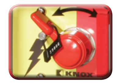
The switch can be tagged with breakaway tamper seals

Many jurisdictions are adopting these requirements early, however, before now no product has been commercially available to meet the needs of this application. Building owners have therefore resorted to their own solutions. In many cases, standard off-the-shelf outdoor enclosures have been used to house push buttons, mushroom switches or key switches that are wired into a shunt trip circuit. The difficulty with this approach is that any enclosures used for this application must meet UL requirements for industrial control housing switches (UL508, now transitioning to UL60947-1). Most commercially available electrical enclosures meeting these requirements lack the necessary security to be used as an emergency shunt trip station. An emergency shunt trip station must be adequately protected against an attack with the intent to cause an unauthorized shut down event which could cause damage to sensitive systems and incur considerable expense in lost time, data corruption, or system restart costs.