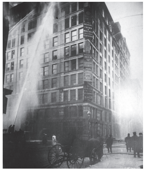
1911 Triangle Factory Fire; Source: irl.cornell.edu situation. It was over a short time later. The tallest ladders in existence could only reach part way up the building, floors below the fire. The stairwells were full of panicked victims and the elevators had buckled and were stuck because of the extreme temperatures. The firefighters and terrified onlookers watched helplessly for 17 minutes as 58 people jumped from the top floors to their certain deaths to escape the impinging smoke, heat and flames. The bodies were piled on the fire hose to the point the crews could not move and advance attack lines. The carnage was beyond description. The incident

It was a beautiful day in New York. Lower Manhattan was bustling. The fire department had the most modern equipment and well trained firefighters available. They had a quick response, with the first arriving engines getting on scene just minutes after the alarm. When they arrived it was already too late. They looked up at the top of the high rise building and could immediately see the enormity and hopelessness of the