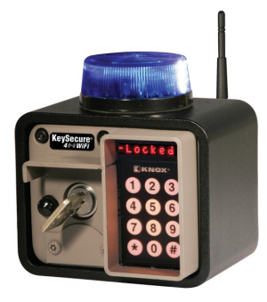
KeySecure® Key Retention

To help maintain the integrity of their system, Wylie stores first line fire apparatus master keys in KeySecure® units. The KeySecure Master Key Retention