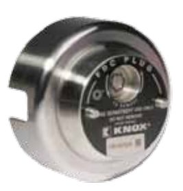
Knox® FDC Plug with Swivel-Guard™

Dallas Fire and Rescue is a full service department providing service to a population of 1.3 million.