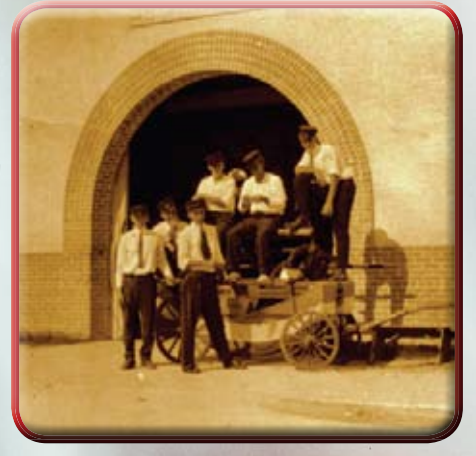
West Palm Beach Fire at the turn of the century

Prior to installing the plugs, West Palm Beach trained all fire prevention staff at a facility that had the plugs. Information on the plugs was shared with all the crews from West Palm Beach's fire stations. Additionally, they made sure all apparatus had a keywrench to unlock and remove the plugs, if needed. "We recently ordered additional keywrenches for a neighboring department that provides some cross over