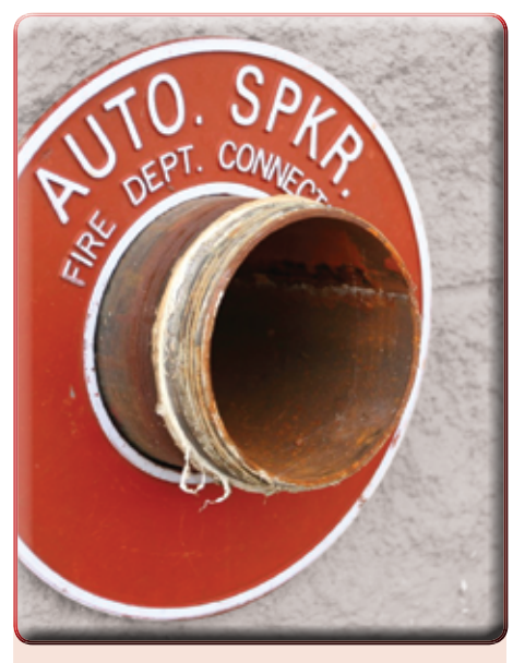
Take a look at your community. Look for vulnerabilities and security risks. Use Knox products to help address these emerging needs.

Examine the fire sprinkler connections in your community. Are FDC caps or the entire threaded swivel missing? The Knox FDC Protection Program is a safe, inexpensive and effective way to protect automatic sprinkler and standpipe systems in your community.