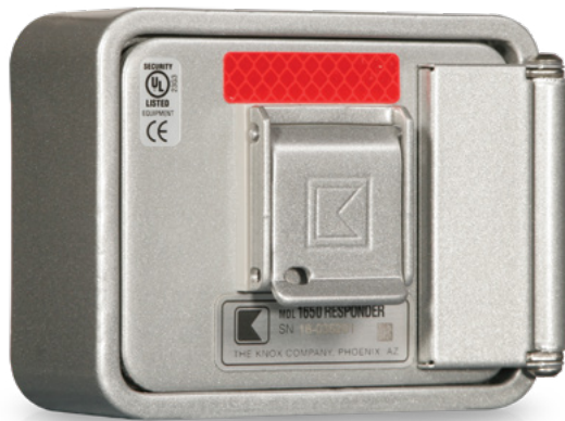
Surface Mount Model #1662