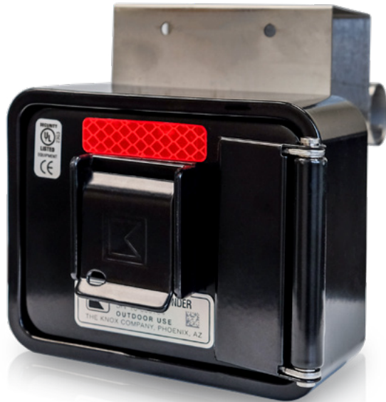
Door Hanger Model #1659